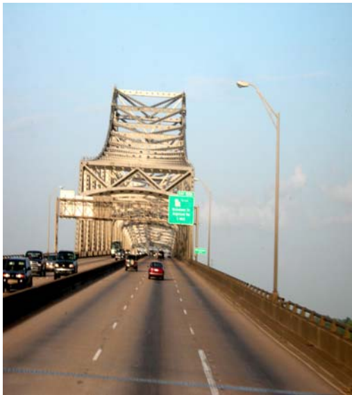
We crossed a bridge in Louisiana over the enormous Mississippi river.

2008 LULAC 79 th National Youth Convention July 7-12, 2008 Washington, D.C.