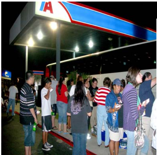
We stopped at a local truck stop at 8:30 p.m. last night for re-fueling purposes in addition to serving hot dogs, coca-cola products and chips in Slidell, Louisiana.